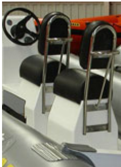
STANDARD CONSOLE & MODULE