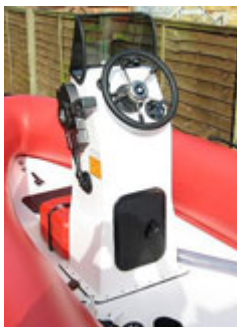
COLUMN STEERING CONSOLE

Quoted for is the non jockey – open vessel with tiller control.. Other options are available.