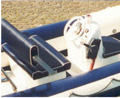
PEDESTAL & BENCH