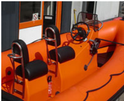
SPORTS CONSOLE & SEAT MODULE