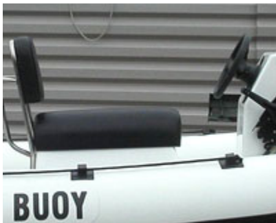
TWO MAN STANDARD CONSOLE